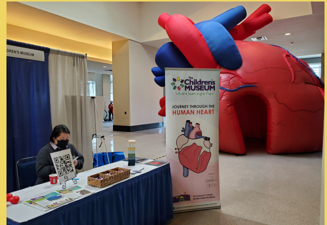
The Northeast Louisiana Children's Museum hosted a vendor booth that included the giant inflatable heart